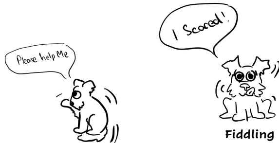
Friend / Appease