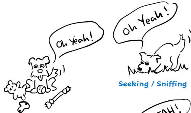
Play / Toys