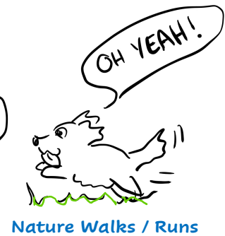
Nature Walks / Runs