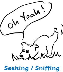
Seeking / Sniffing