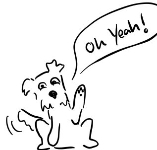
Learning / Direction